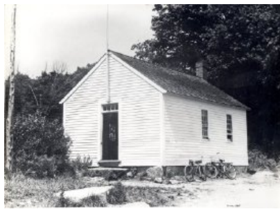
Gallup School # 8

The Ledyard Historical Society has been busy digitizing and cataloging the contents of the Janice W. Bell Historical Research Room at the Bill Library. This is an ongoing project that will provide online access to the documents, pictures, maps, diaries, etc., from the Society's website at