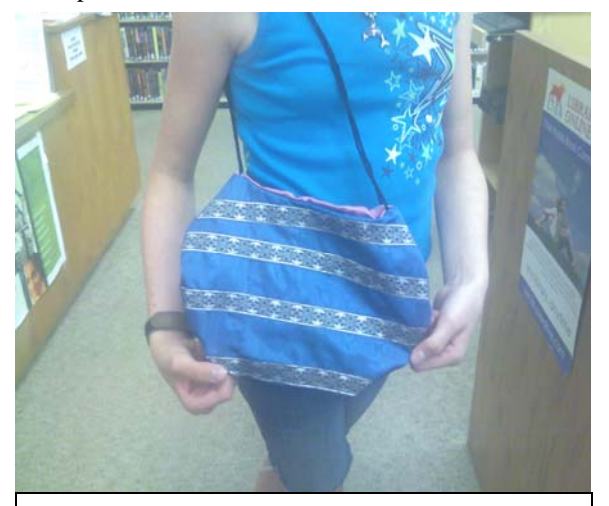
Sample purse made in the sewing workshop

your suggestions to make our program better than ever! Anyone who missed the Ice Cream Social may pick up their Volunteer Certificate at their library. The certificates document your participation and state the number of hours worked this year, as recorded on your registration sheets and in the Teen Friends Binder. I also have a few left over from last year, so let me know if you haven't picked up yours from 2007. You may reach me by email from the Teen Page, at <a href="teenlibrarian@ledyard.lioninc.org">teenlibrarian@ledyard.lioninc.org</a>, or by calling either library. Have a great school year, and keep in touch!